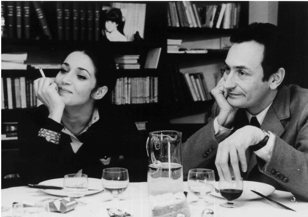
Figure 1: My Night at Maud's (Eric Rohmer, 1969)

W2: Digital Swarms Byung-Chul Han is a Korean-German philosopher who is best known for his short but influential book The Burnout Society (2015, originally published in German as Müdigkeitsgesellschaft , 2010). If you're interested, this YouTube documentary (see right) is a good introduction to Han and his work.